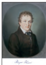
1 Portrait by Kreul

Three portraits of the „Child of Europe“, one handwritten verse and five watercolors by Kaspar Hauser