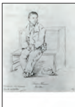
3 Drawing by K. Hitz