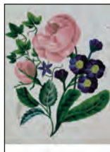
10 Rose and primroses