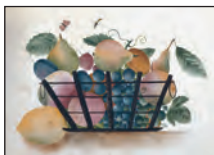
6 Fruit basket